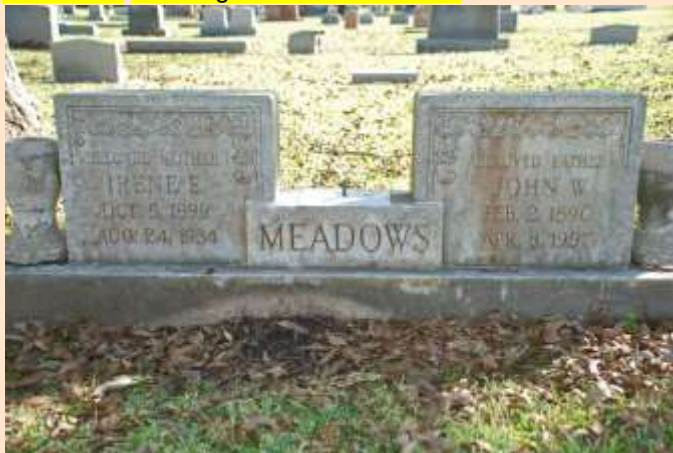
findagrave.com Sweeny cemetery

went by Meadows as shown on his tombstone & death certificate. Kids & grandkids Meadows.