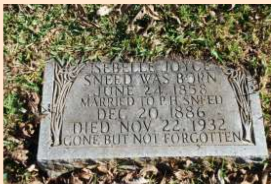
findagrave.com Sweeny cemetery