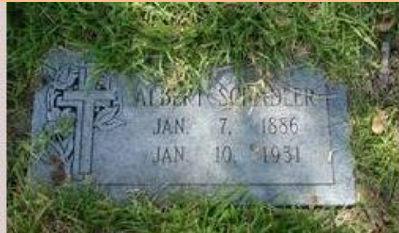
Confederate cemetery, Alvin, TX