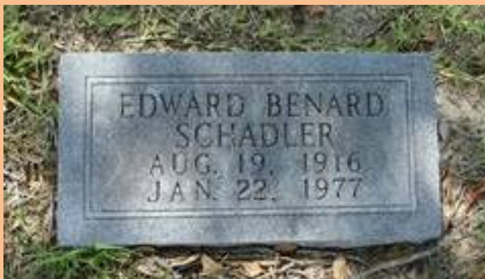
Confederate cemetery, Alvin, TX