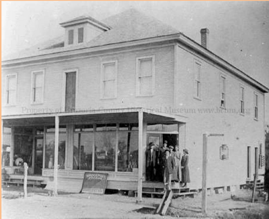
Schadler & Son store Sweeny